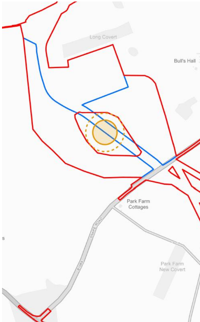
Image 1: Proposed order limit change by National Grid (blue to red)